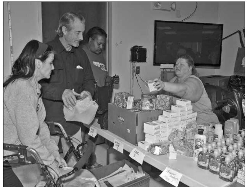
Pictured below: An Adams Park resident volunteer (seated right) helps distribute personal care items during the "Blessing Party."