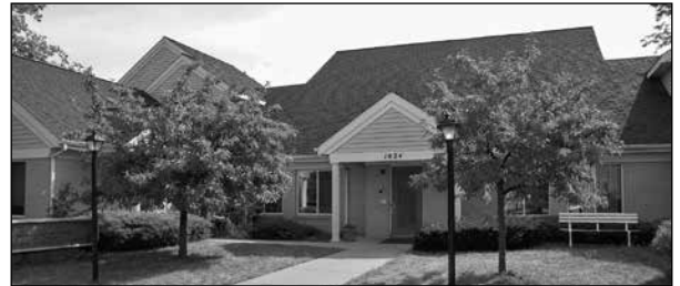
The Hope Community Service Center.

The Housing Commission has selected M.C. Smith Associates and Architectural Group to provide architectural and engineering services for these capital improvement projects.