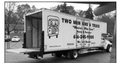
Above: Two Men and a Truck delivered food from the USDA Commodity Supplemental Food Program.