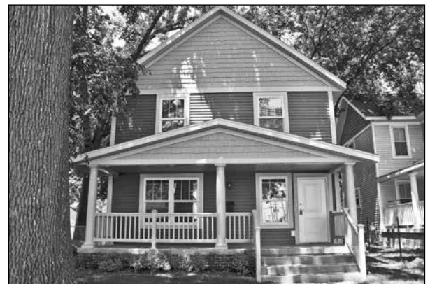
One of 23 single-family home ownership units that will be sold to low-income families.

The GRHC plans to apply to HUD’s “Moving to Work” (MTW) Demonstration Program, which affords public housing authorities the flexibility to use their federal funding to develop strategies that meet specific local needs. Participation in MTW