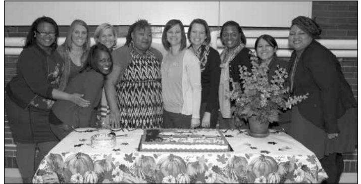
GRHC Resident Services Specialists were on hand to thank the many generous community partners who assist our residents and agency. We are very grateful for your support!

Grand Valley State University (GVSU) GVSU Kirkhof College of Nursing Holland Home Home Instead Senior Care Hurst Mechanical Indian Trails