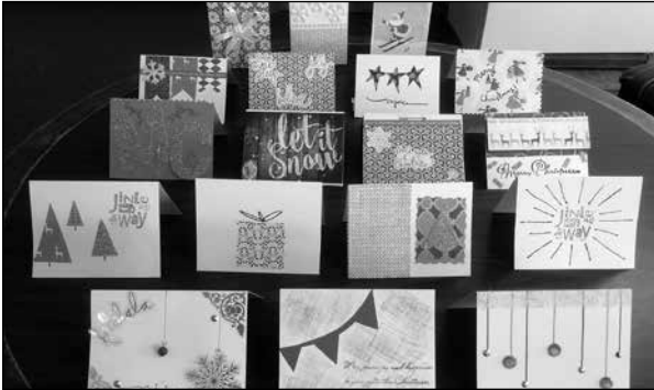
A few of the colorful holiday cards created by Hope Community Rapid Re-Housing Program residents.