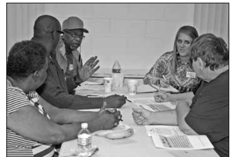
Leonard Terrace residents and GRHC staff brainstorm ideas for making Grand Rapids more “age friendly.”

health services. Residents were invited to join work groups that are being formed to further explore these topics. For more information about this ongoing initiative, contact the City Planning Department at 456-3051.