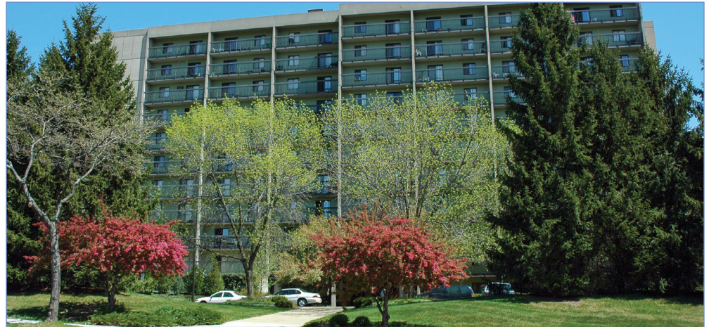
50 Ransom Avenue NE, Grand Rapids, MI 49503 | (616) 235-2881

Conveniently located near downtown cultural and recreational resources, Ransom Tower offers secure, comfortable retirement living for ages 62 and older. Eligible tenants receive a federal rental subsidy, which means rent is not more than 30 percent of the household's adjusted monthly income.