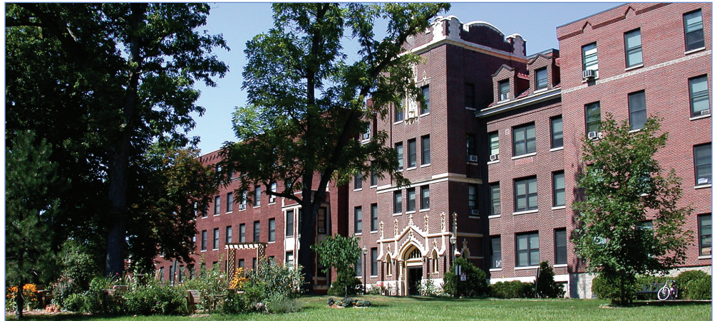
1425 & 1511 Bridge Street NW, Grand Rapids, MI 49504 | (616) 235-2843

Built in 1917 as a Catholic convent and private school, Mount Mercy was acquired by the Grand Rapids Housing Commission (GRHC) in 1991 and renovated to provide 125 affordable retirement apartments for ages 55 and older. The beautiful and historic structure is located on 30 rolling, park-like acres just northwest of downtown Grand Rapids.