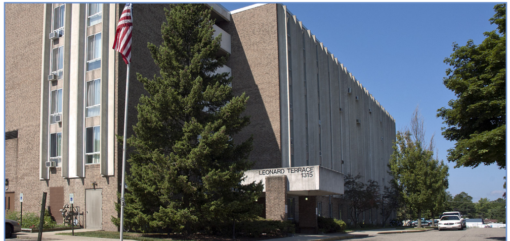
1315 Leonard Street NE, Grand Rapids, MI 49505 | (616) 235-2890

Conveniently located just steps from a supermarket, shopping center, bank and bus stop, Leonard Terrace offers secure, comfortable retirement living for ages 55 and older. Eligible tenants receive a federal rental subsidy, which means rent is not more than 30 percent of the household's adjusted monthly income.