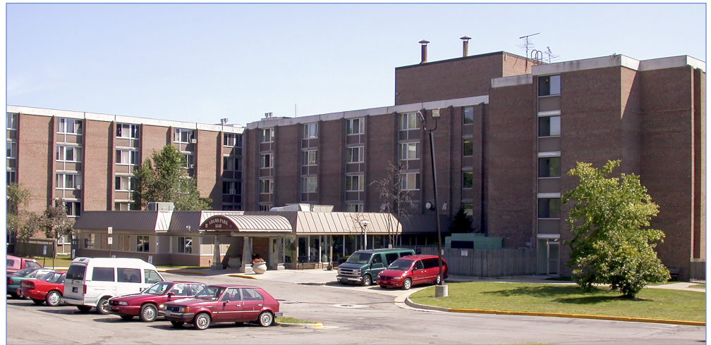
1440 Fuller Avenue SE, Grand Rapids, MI 49507 | (616) 235-2865

Conveniently located near shopping and transportation, Adams Park is a 188-unit development that serves people with disabilities and seniors ages 62 and older. Eligible tenants receive a federal rental subsidy, which means rent is not more than 30 percent of the household's adjusted monthly income.